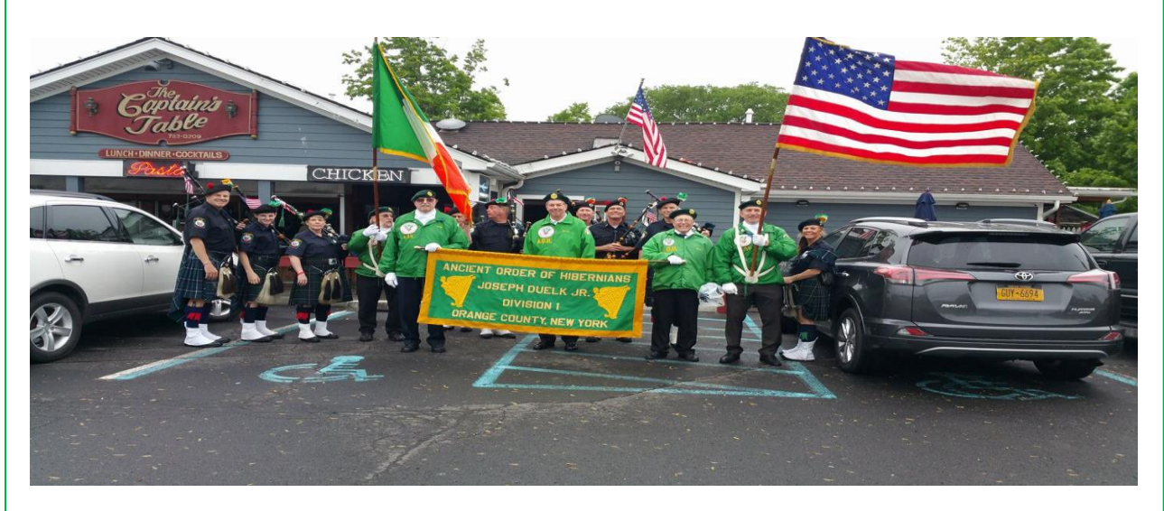
Memorial Day Parade Monroe AOH Pipes and Drums and Division 1